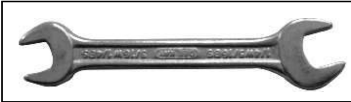
P-32 - 7.5/6 MM - QTY. - 2