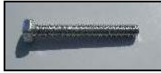
P-28 - 62x7.5MM - QTY. - 8