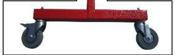
P-9 - 560x165x38x38 MM - QTY. - 4