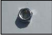
P-28 - 7.5MM - QTY. - 8